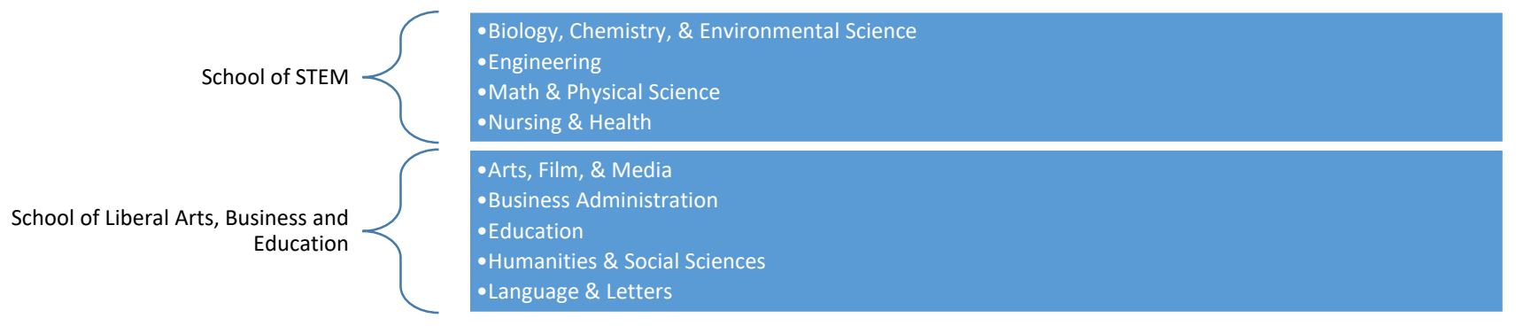
Figure 1: Academic Departments within the Schools

The cohort is the entire student body in Fall 2017 and Fall 2018. Students' declared majors are identified for the cohort term and they are categorized into the nine academic departments. Students with undeclared majors and dual credit students are also included and grouped together.